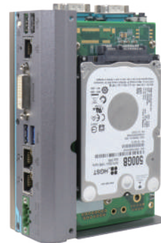
▲ POC-300 with MeziO™ - R11 and 2.5" HDD

** For sub-zero operating temperature, a wide temperature HDD drive or Solid State Disk (SSD) is required.