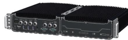
▲ SEMIL 19" rack-mounted