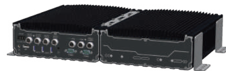
▲ SEMIL wall-mounted